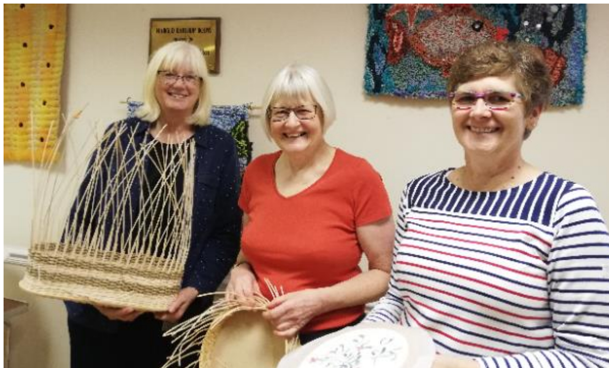
A photo of our wonderful craft volunteers

Thank you most sincerely to you all on behalf of the members and staff for your help and support.