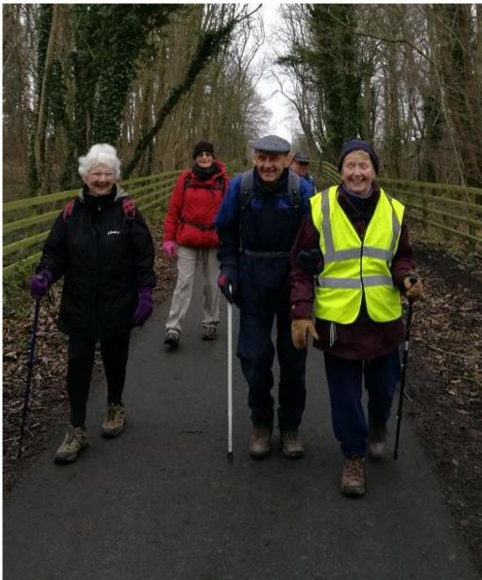
Some of our walking group members and volunteers enjoying one of their monthly walks.