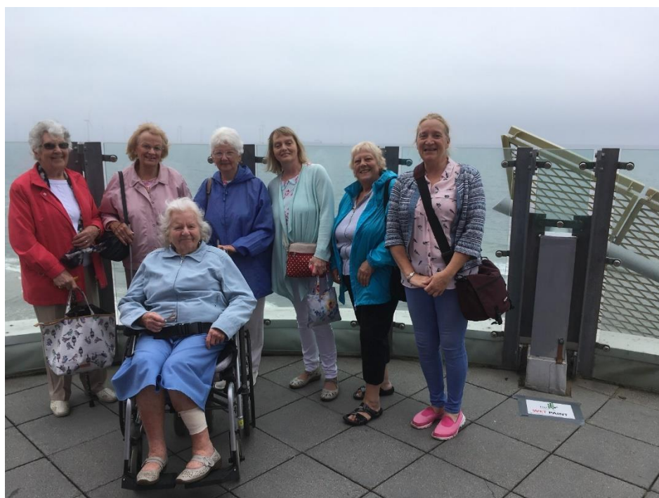
Some of our members and volunteers enjoying a day trip to Redcar.